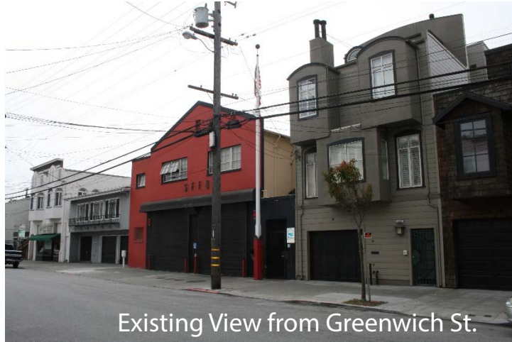
Existing View from Greenwich St.