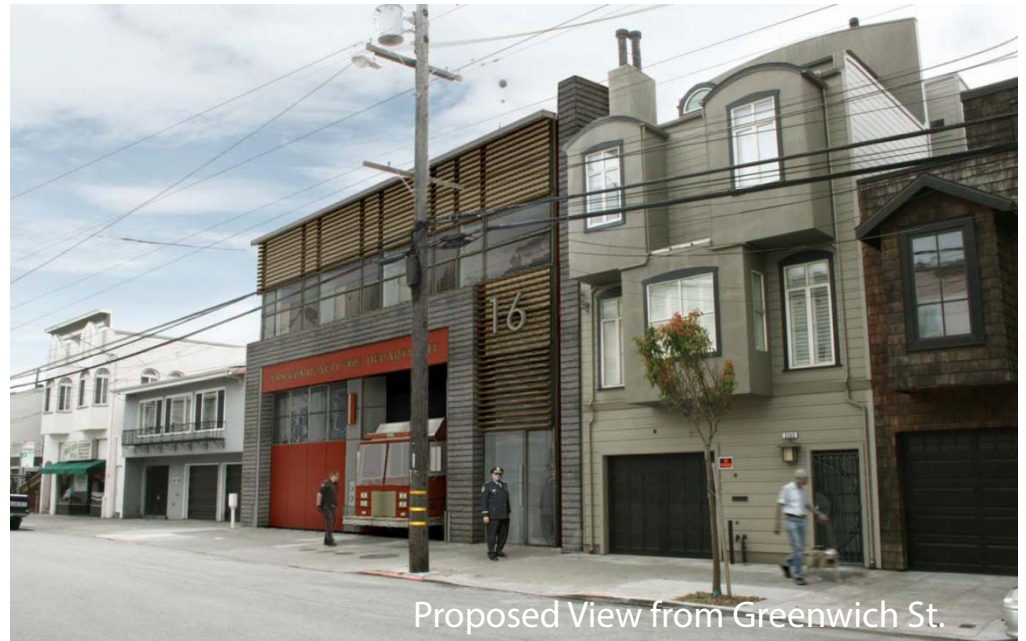
Proposed View from Greenwich St.