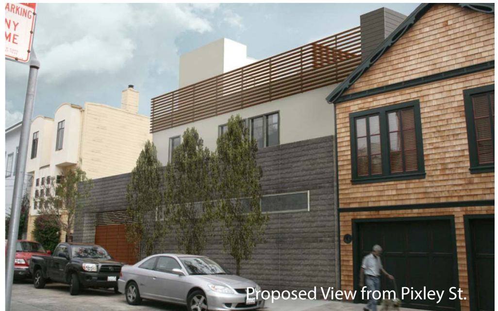
Proposed View from Pixley St.