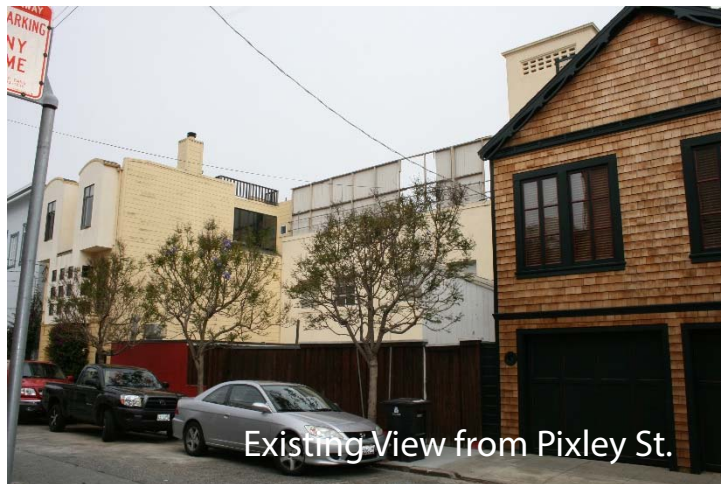
Existing View from Pixley St.