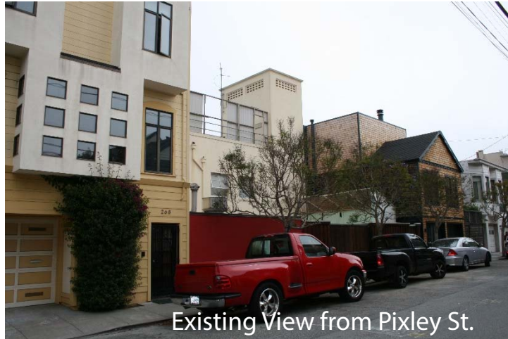
Existing View from Pixley St.