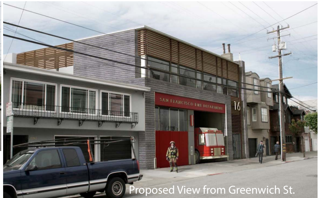
Proposed View from Greenwich St.