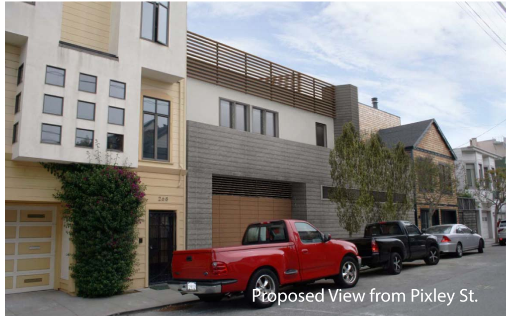
Proposed View from Pixley St.