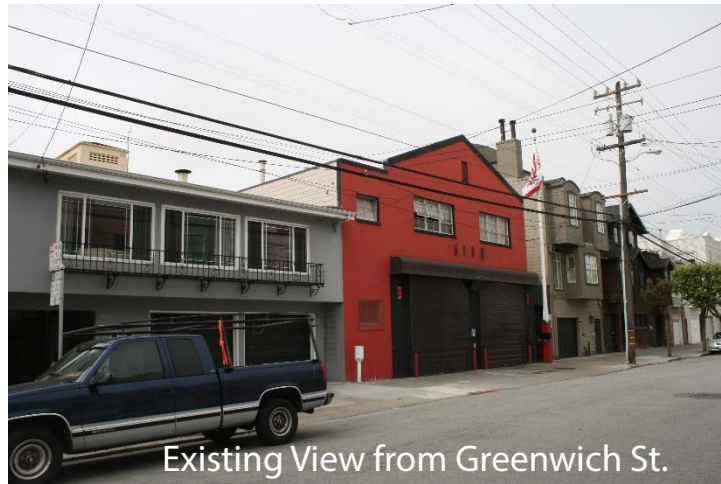
Existing View from Greenwich St.