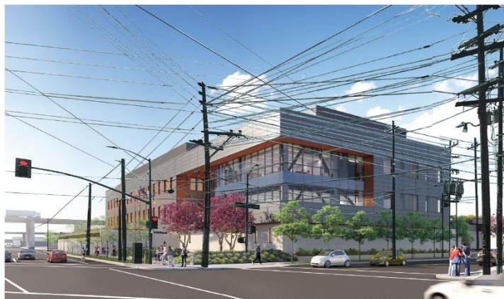
Design Rendering – View from Intersection of Evans Ave. & Toland St.