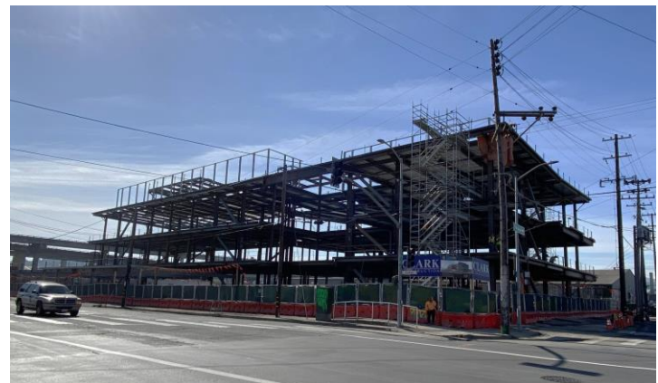
North and West Elevations – View from Intersection of Evans Ave. & Toland St. (February 27, 2020)