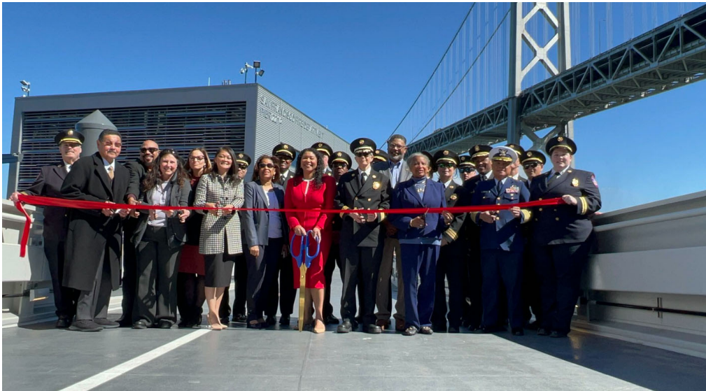
Fireboat Station 35 at Pier 22½, Ribbon Cutting ceremony 3/10/2022