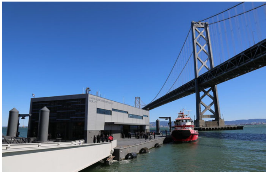
FS35 Ribbon cutting ceremony, March 10 th , 2022

During the current reporting period, the installation of the security fencing, guardrails, the public art sculpture - BOW , and sitework along the Embarcadero was completed. Water service installation was completed in November 2021. Gas, sewer service and permanent power were provided in mid-December 2021. Substantial completion was achieved on February 28, 2021. Projected Final Completion is May 15, 2022. Ribbon Cutting Ceremony held on March 10 th , 2022.