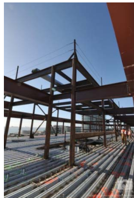
Framing at mechanical penthouse on roof deck