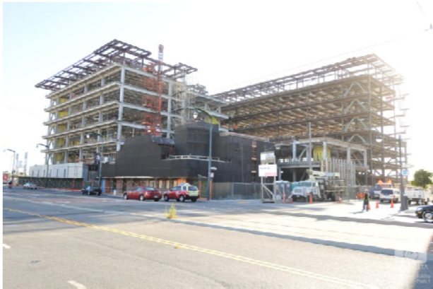
Exterior View of building from 3 rd Street