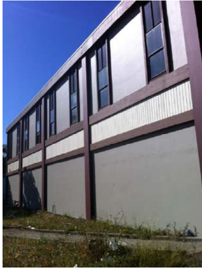
Fire Station 49 Paint