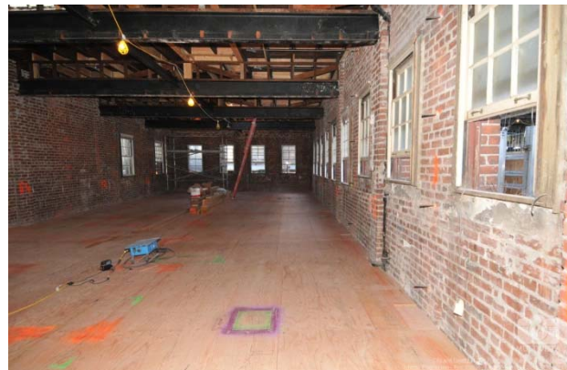
2 nd Floor at Fire Station 30