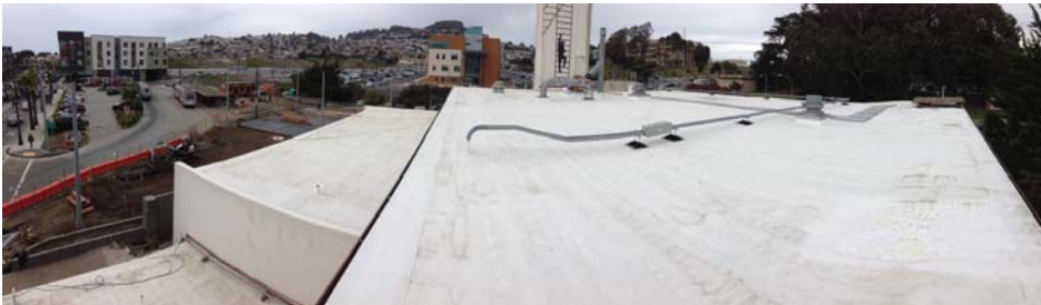
Fire Station No. 15 Roof Replacement