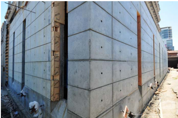
Architectural Concrete at 3 rd and Mission Rock St.