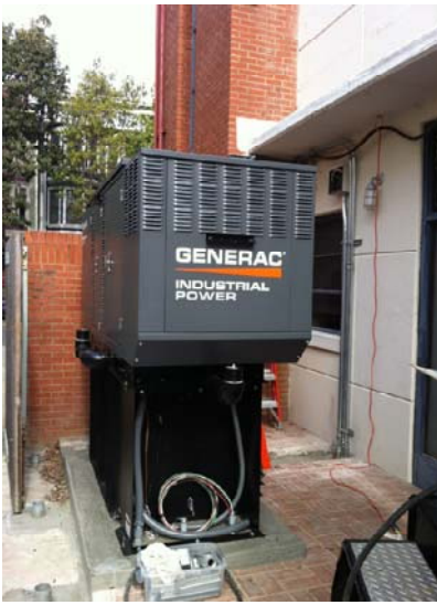
Fire Station No. 6 Emergency Generator Replacement