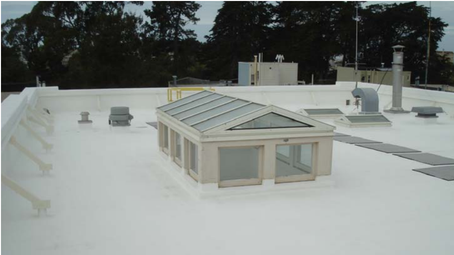
Fire Station No. 40 Roof Replacement