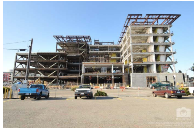
North Elevation of building