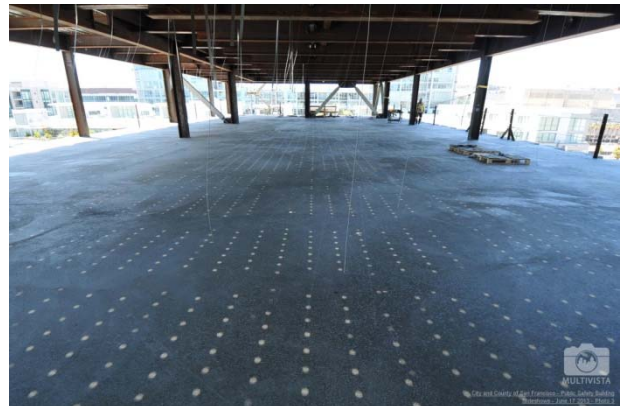
Completed Floor Slab on 5 th Floor at West Tower