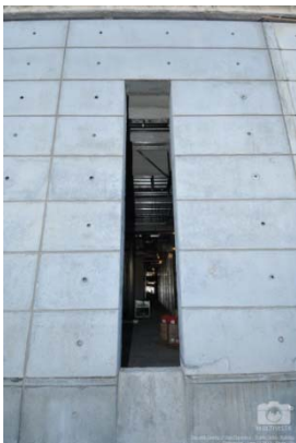
Opening at Street Level Architectural Concrete Wall