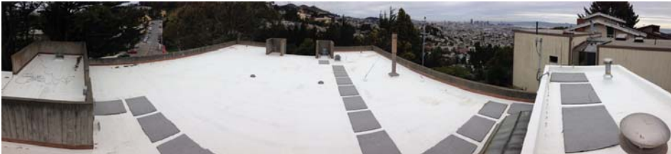
Fire Station No. 26 Roof Replacement