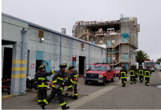
Existing SFFD Training Facility at Treasure Island

sfpublicworks.org facebook.com/sfpublicworks twitter.com/sfpublicworks