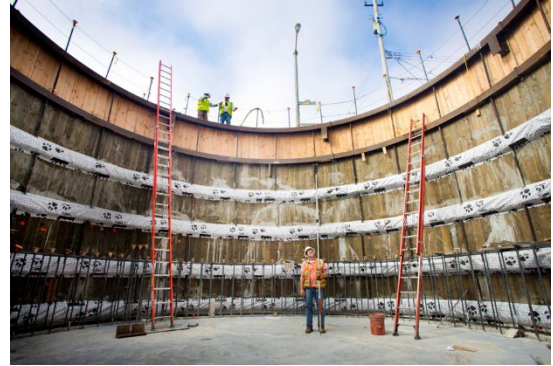
Construction of a Cistern, a Component of the EFWS