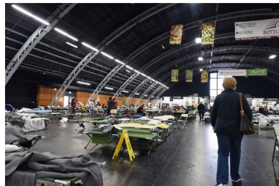
Example of a Disaster Response Facility