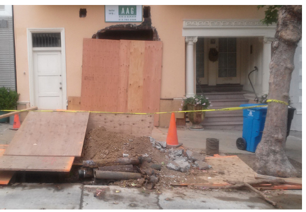
VIOLATION: Exceeding permissible use