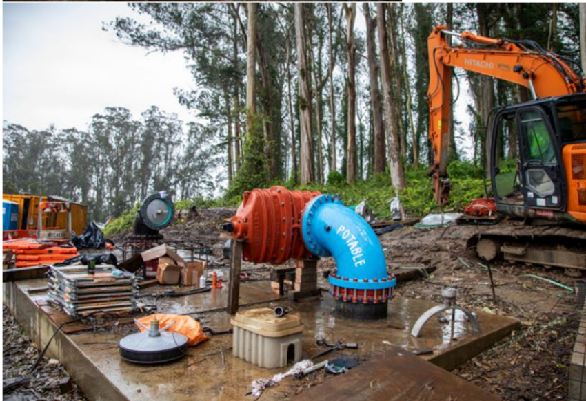
Clarendon Supply Site