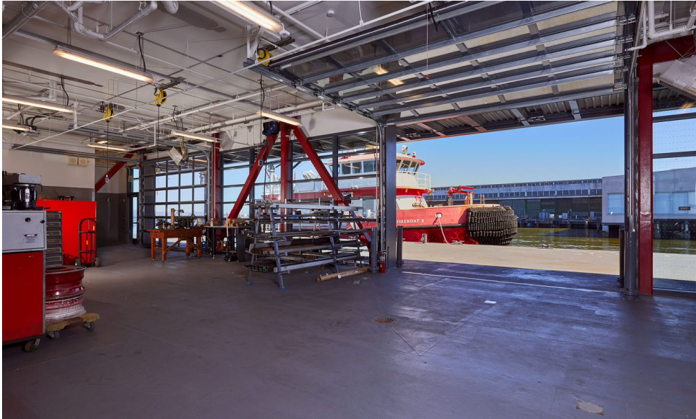
Fire Station 35 at Pier 22½