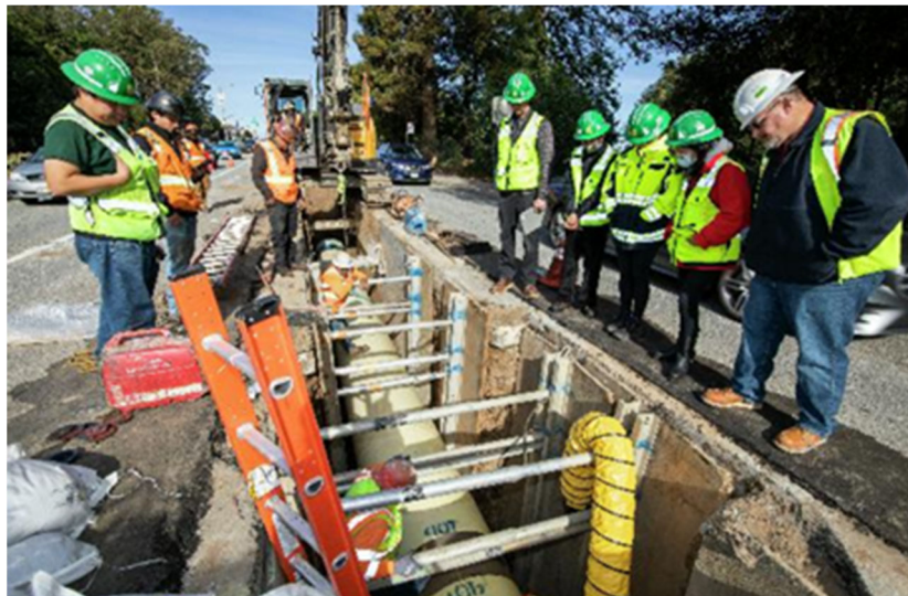
19th Avenue – Installation of the 36-inch pipeline, EFWS 2020