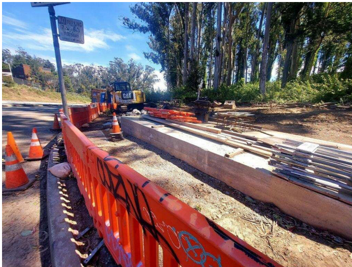
Clarendon Supply Site