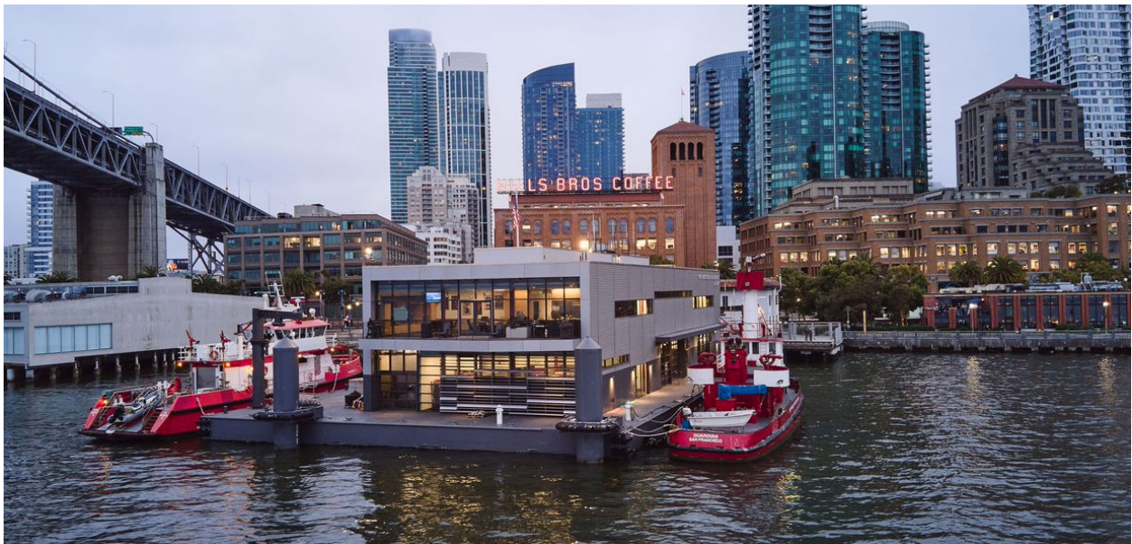
Fire Station 35 at Pier 22½