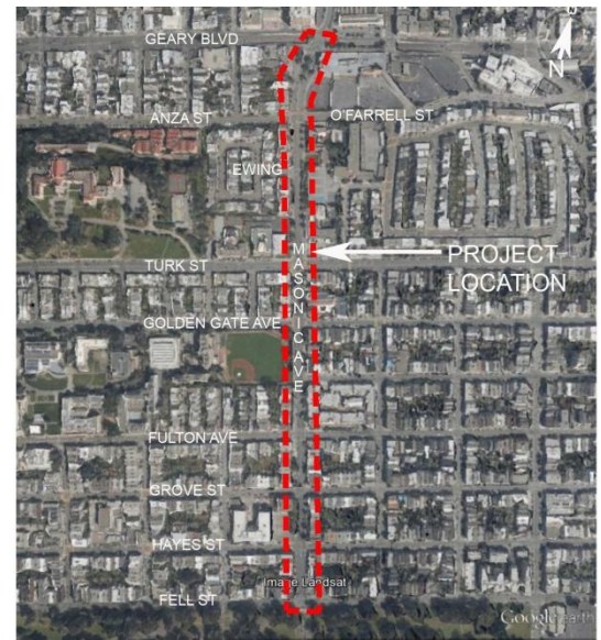
Project boundary from Geary Boulevard to Fell Street