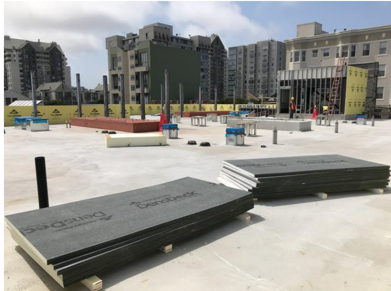
Skylight and Mechanical Unit Curbs Set at Roof (June 6, 2018)