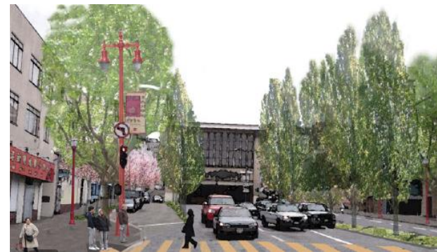
Street trees line Broadway