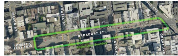
Project boundary from Columbus Ave to Broadway tunnel