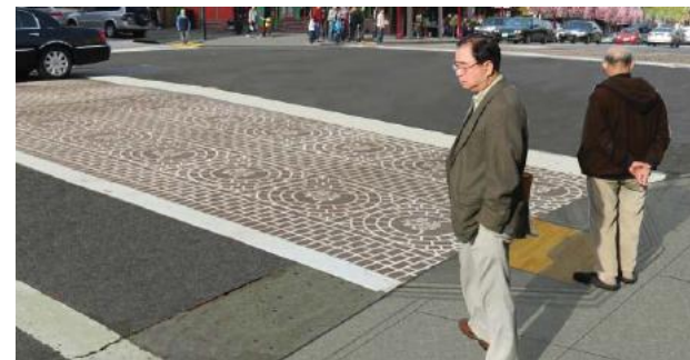
Neighborhood defining decorative paving at crosswalk