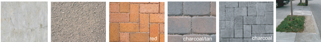
Option 1 Concrete Paving Option 2 Decomposed Granite Option 3 Unit Pavers on Aggregate Base (red) Option 4 Permeable Pavers on Aggregate Base (charcoal/tan, charcoal) Example