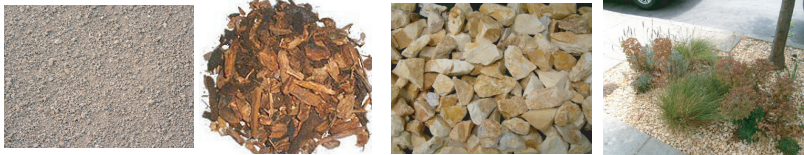
Option 1 Decomposed Granite Option 2 Bark Chips Option 3 Stone Mulch in Gold Example