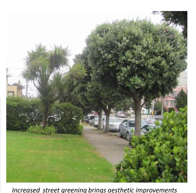
increased street greening brings destrictic improvements