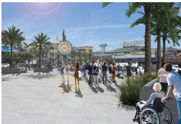
Rendering of Fisherman's Wharf Plaza, at Jefferson St. and Taylor St. Construction on Sequence I begins the week of October 21, 2019

www.sfpublicworks.org/jefferson facebook.com/sfpublicworks twitter.com/sfpublicworks