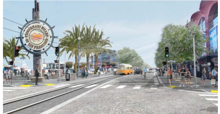
Jefferson Street at Taylor Street Eastbound View Rendering - September 2019