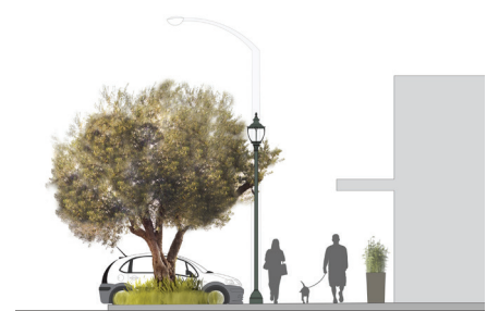
New Pedestrian-scale Lighting will provide a safer environment for pedestrians at night.