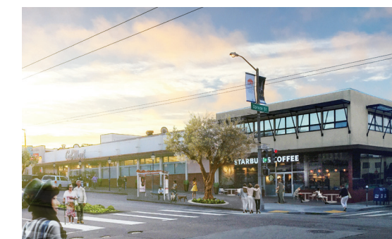
New Bus Stop Bulb in front of Starbucks will make Muni more reliable by reducing the need to pull in and out of bus zones. It will also allow for additional pedestrian space and a more robust 'gateway' to Laurel Village.