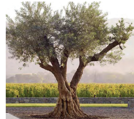
Heritage Olive Trees are proposed to be planted along the south side of California Street. Standard olive trees will be planted on the north side.

JOIN CITY STAFF FOR COFFEE!!! AND TO REVIEW THE PROJECT PROPOSAL AND CONSTRUCTION TIMELINE Friday, March 9th 9:00 - 11:00am -AND- 4:00 - 6:00pm Saturday, March 10th 9:00 - 11:00am Locust Street Plaza (fronting Books, Inc. & Toss)