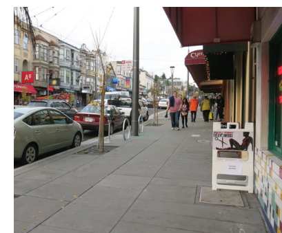
New Sidewalks will provide a safe and comfortable shopping experience for pedestrians, and will remedy the steep cross-slope near Cal-Mart and Starbucks.